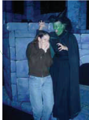
Our corporate president welcomes you.

Fans eat at the K9 Coffee Gar- den located in a real garden.