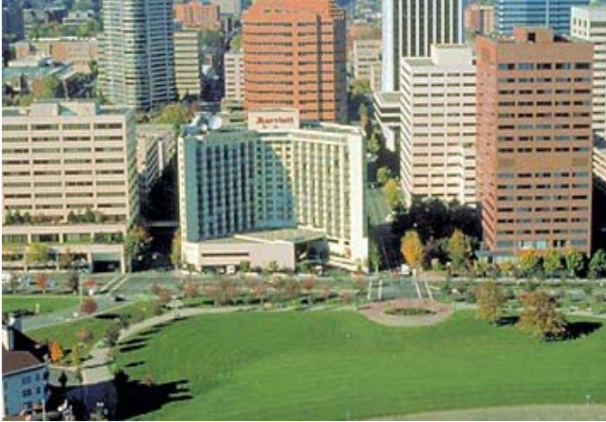
Where we are going this year