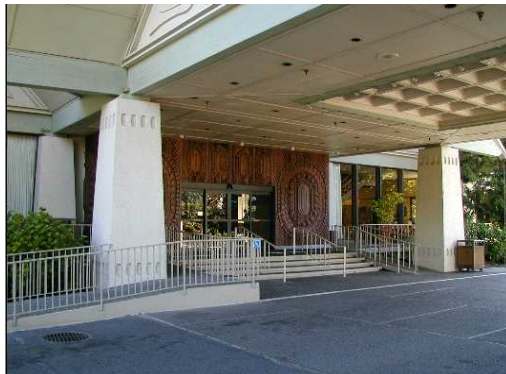
Our Former Orycon Home

I need more of the ideas of those who are planning to attend, and to know what you consider to be your areas of expertise for a program. With the philosophy that we all learn from each other, I'd like to have a wide variety of people appear on the program.