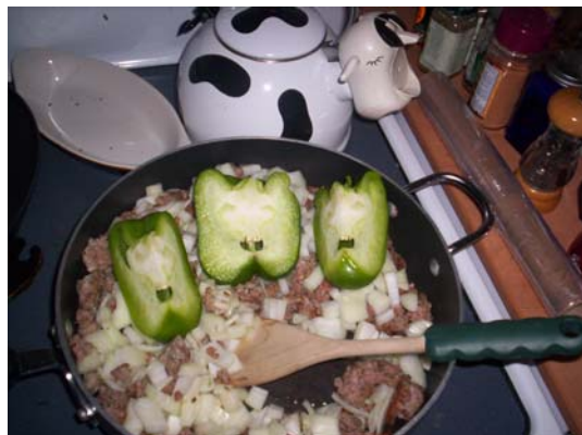
Evil Green Peppers take over Family dinner

Photographs would be fun too, should you have anything suitably weird.